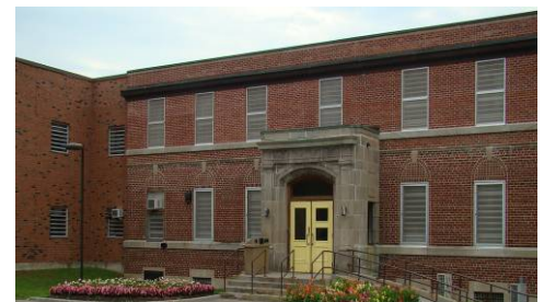
The existing Oak Ridge facility will be replaced with a new, state-of-the-art hospital.

IO and MHCP expect to announce the successful project team in late 2010 and construction is scheduled to begin in early 2011. Until we have selected the project team and have been provided their construction schedule, it is premature for us to commit to firm start or completion dates.